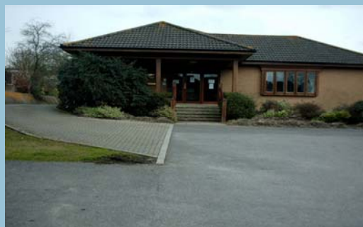
TUNNEL ROAD SURGERY