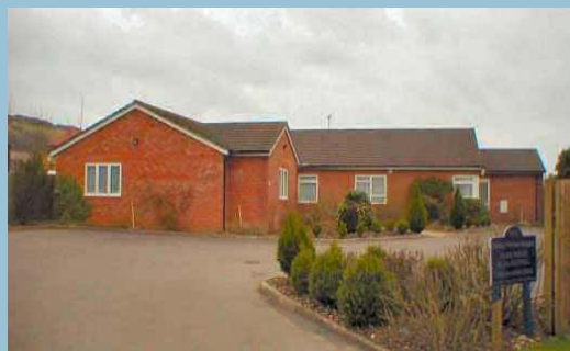
MAIDEN NEWTON SURGERY